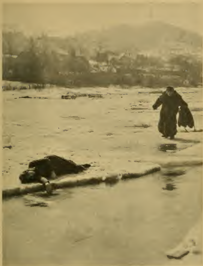
THE RIVER SCENE IN "WAY DOWN EAST"